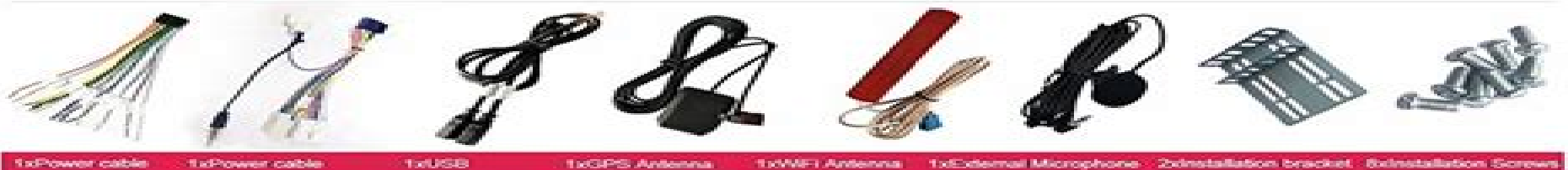
1xPower cable 1xPower cable 1xUSB 1xGPS Antenna 1xWiFi Antenna 1xExternal Microphone 2xInstallation bracket 5xInstallation Screws